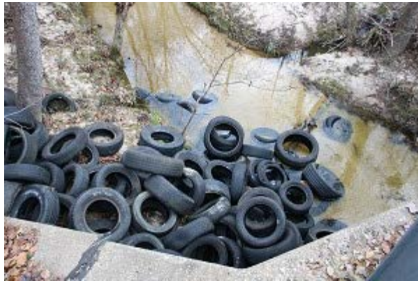
Point Lookout Road.

Anyone seeing a vehicle fitting this description is encouraged to call 911 and report it as suspicious activity.